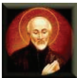
Father Isaac Jogues