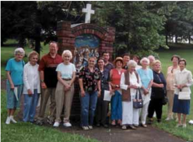
Photo Collage of Season